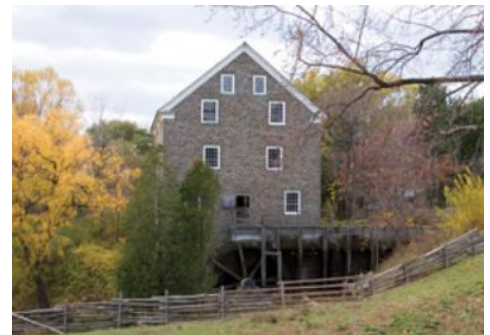
Black Creek Pioneer Village

When was the last time you visited Black Creek Pioneer Village? Grade 5? Or perhaps you took your kids or grandkids when they were young? Well, you'll have a very good reason to go next July for the first annual Quilts at the Creek . This is an initiative spearheaded by YHQG member Valerie Prideaux on behalf of the guilds of Southern Ontario. The reaction was amazing when she scouted out the Village buildings and hung up a quilt to test how it looked. There were few people at Black Creek that day, but those that were flocked from all over to look at the quilt, touch it, and talk about it. This initiative is for Black Creek Pioneer Village, supported by the guilds of southern Ontario, to put on an outdoor quilt show in this beautiful environment. The show is fashioned after Calgary's very successful Heritage Park Outdoor